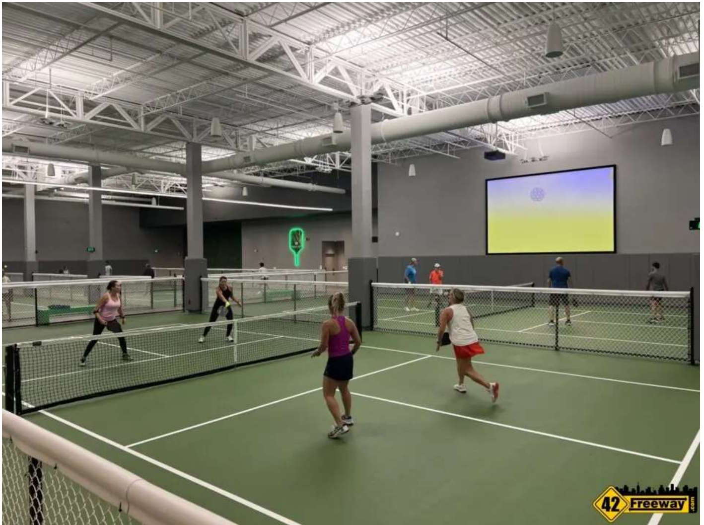
Pickle Juice Pickleball Courts and Juice Bar – Ventnor Heights. They will be opening in 2024 in Blackwood NJ. Expect a similar design style!

Pickleball is a fun game sweeping the country with over 30 million people playing each year! It’s a court smaller than tennis, and a cross between ping pong and tennis. Check the 42Freeway video at the end of the article!